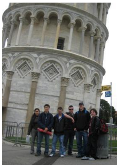
Students on the March '11 Europe trip pose in Pisa