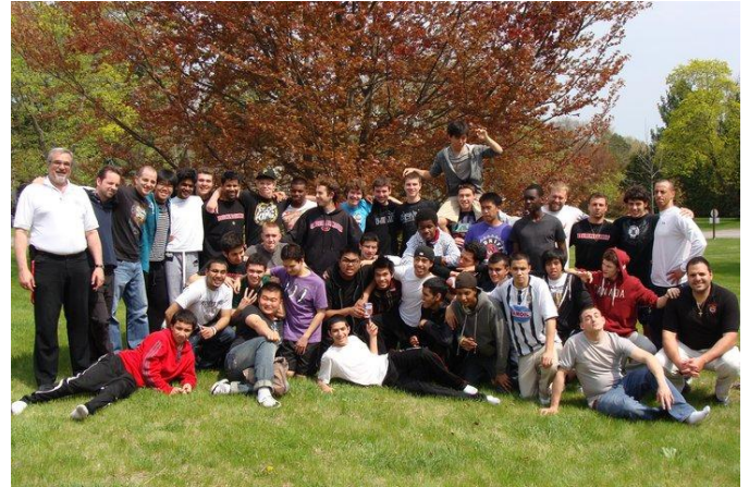
K4 participants at Manresa Retreat Centre