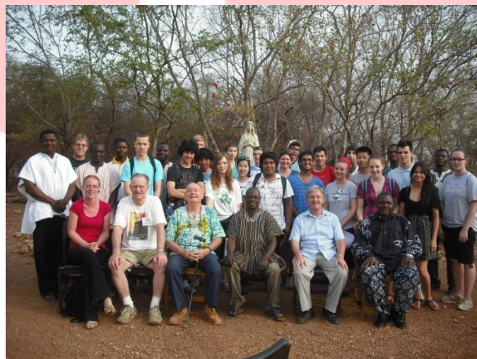
The Canadians pose with the Presentation Brothers at their Novitiate in Logre