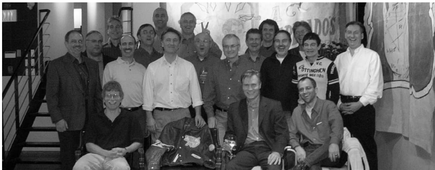
Class of '74 Reunion - photo supplied by Nabil Tadros