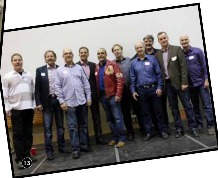
8) Class of 2006.