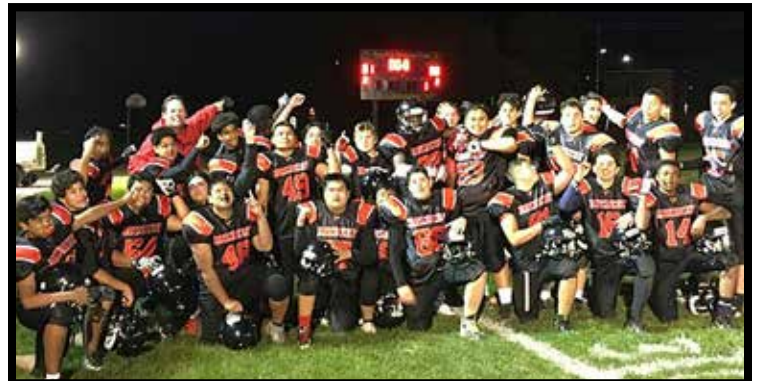
Junior Bulls celebrate their win over Lawrence Park