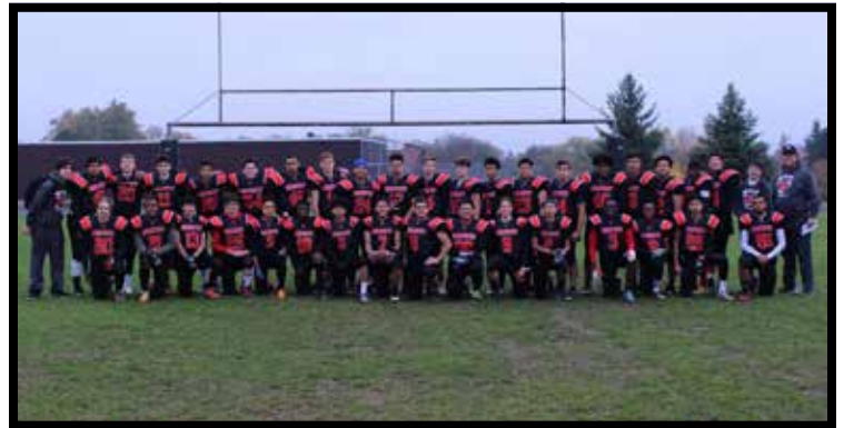
2018 Senior Brebeuf Bulls Football team