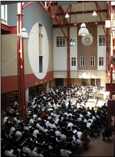
A First Friday Mass in the Atrium on June 5th marks the end of Brebeuf College's forty-fifth academic year