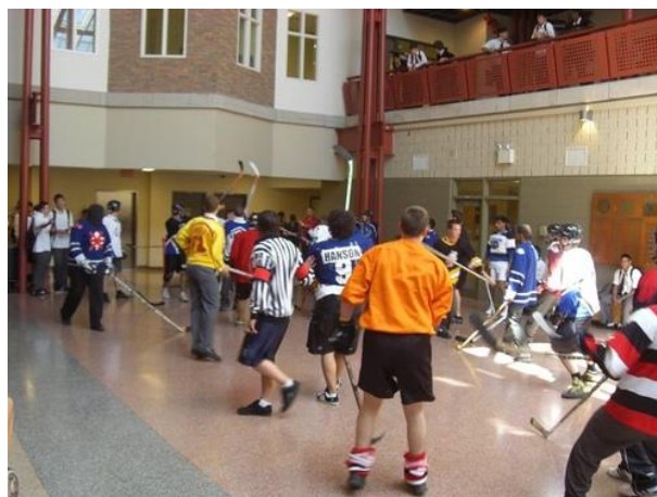
Grade 12's engage in a "Grad Prank" by playing hockey in the Atrium as students and staff look on.

Yamas! Buona Jobba! Auguri! Well Done Brebeuf College European Voyagers!