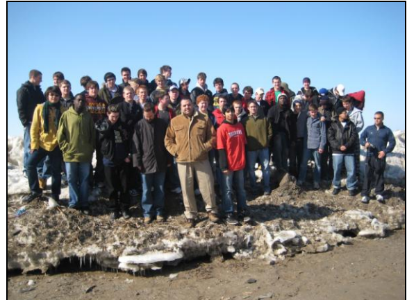
Brebeufians and Canisius students at Kairos '09

Schools with Jesuit roots are known for running excellent retreats. Brebeuf plans to begin offering Jesuit Kairos retreats next year for Gr. 11 students. These retreats have proven invaluable at other schools in developing student leadership, community, and faith.