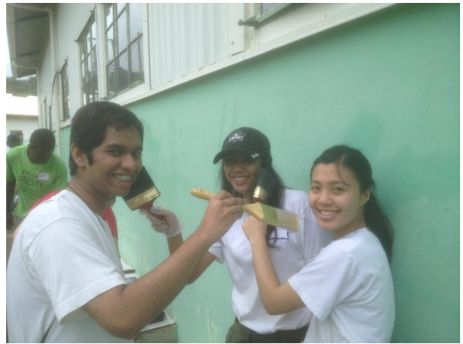
Repainting the CARE centre