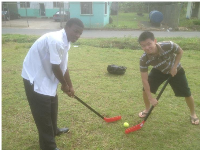
Sharing our Canadian culture!