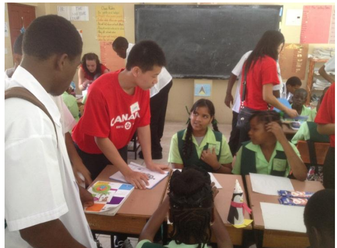
Brebeuf and CARE students teaching the younger ones