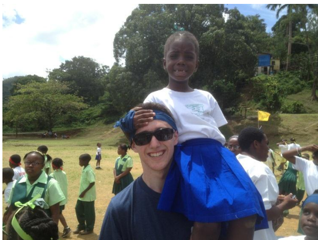
Giving the students a day of fun at the Olympic games