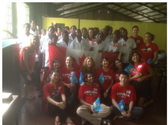
Opening festivities at the CARE centre