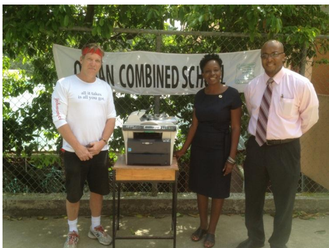
Presenting the school with a gift of a photocopier