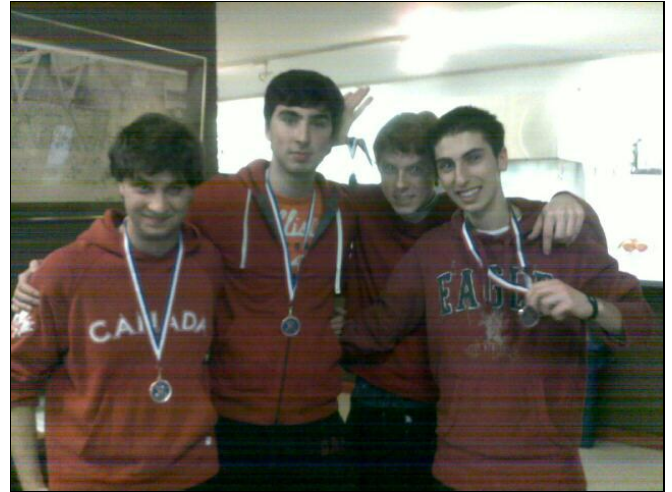
The Bronze-winning Recreational Curling Team