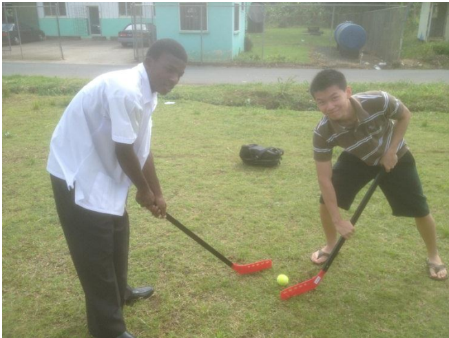
Sharing our Canadian culture!