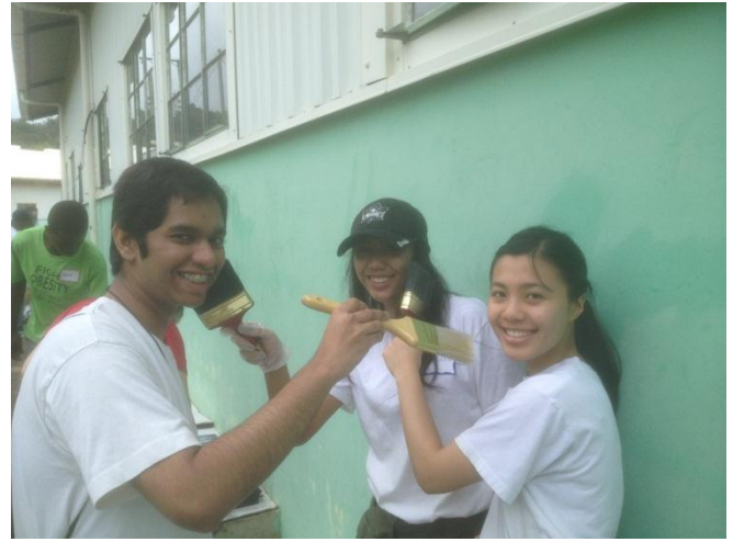
Repainting the CARE centre