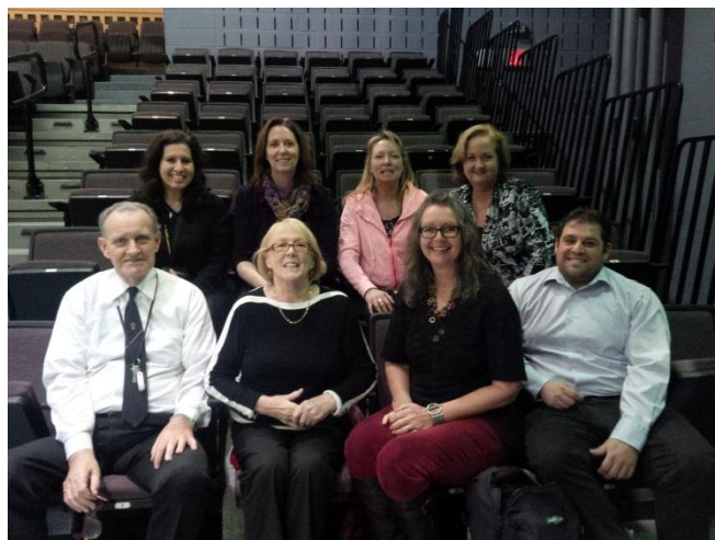
Some VICS Staff and adult supporters