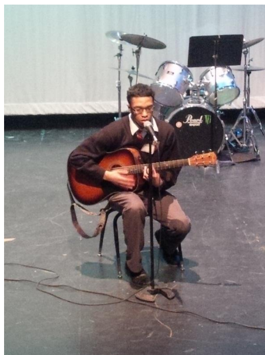
A VICS faster performs for his peers