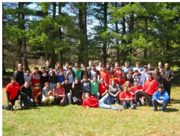
Brebeuf's Kairos 7 retreatants in May, 2013