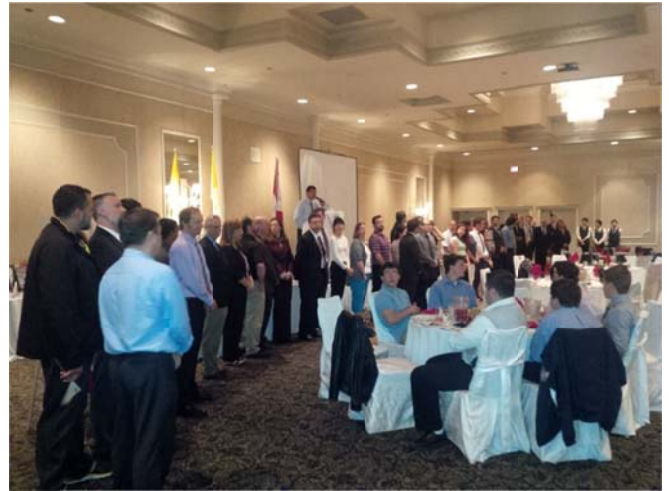
Athletic Banquet 2013