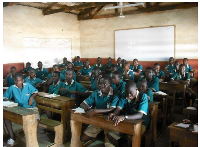
Students from St. Charles Lwanga School in Yendi, Ghana, one of the schools that Brebeuf helps to support.

This year, a new club of students called PresLink is helping in these fundraising endeavours. Meetings are every Thursday after school in the library.