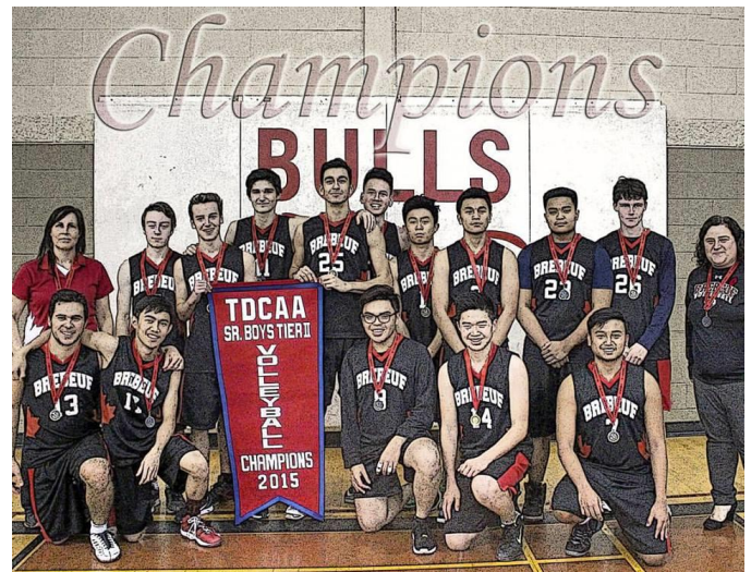
The Senior Volleyball team won the 2015 TDCAA Championship!