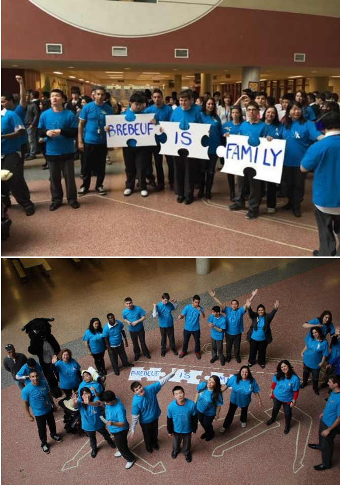
Students and staff in the ME/DD classes celebrating World Autism Day in the atrium.