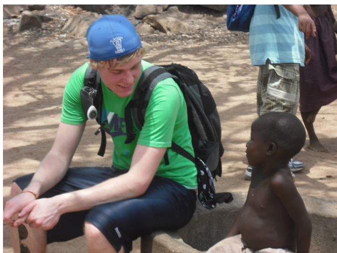
A Brebeuf student making a new Ghanaian friend during the 2011 Ghana trip