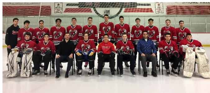
Varsity Hockey Team