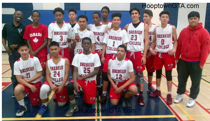
Junior Basketball Team