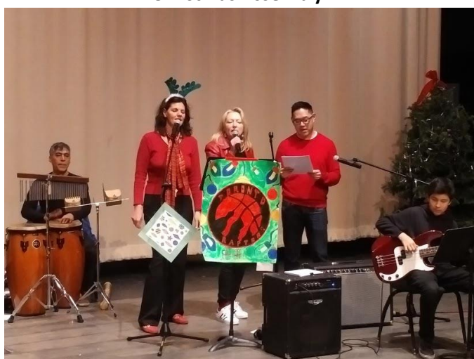
The staff get into the Christmas spirit!