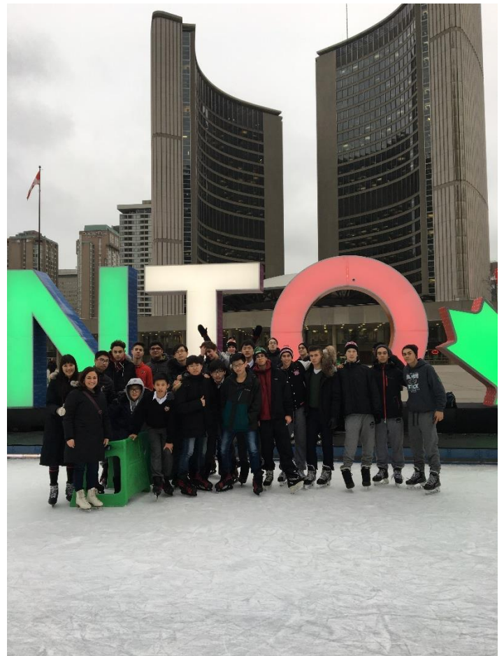
International students at Toronto City Hall

Recently, the group went skating at Nathan Phillips Square. For the majority of these international students, it was their first time on the ice! They picked up this quintessential Canadian skill quite quickly under the tutelage of their fellow Brebeuf hockey players. Brebeufians prove to be Men for Others, both on and off the ice!