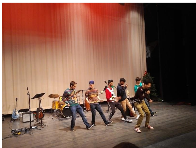
The men of Student Council strut their stuff at the Christmas Assembly.