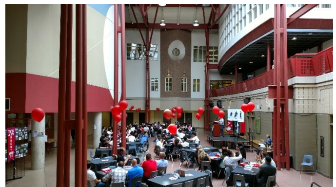
Athletic Banquet 2017