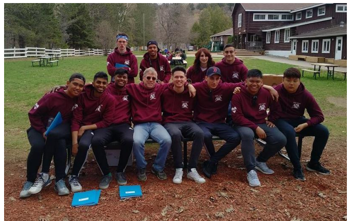
Brebeuf's Core Team of Leaders