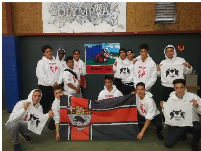
The Brebeuf delegation showing off their school spirit!