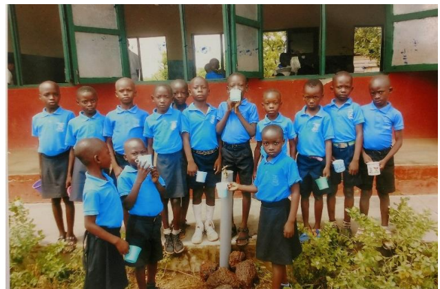
Students at the new Presentation School in Han, Ghana getting clean water from a well that Brebeuf helped to fund.