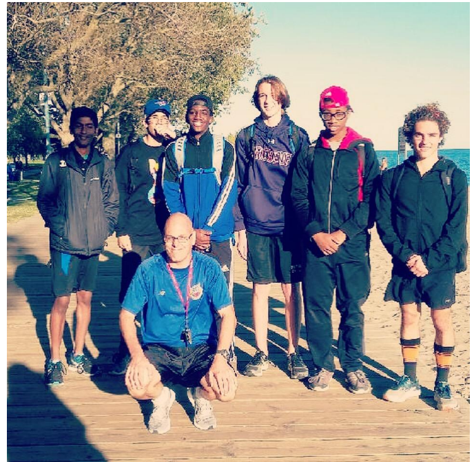
The cross-country team