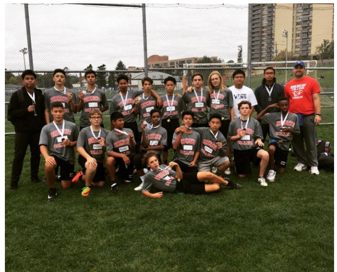
The bronze medallists in Gr. 9 flag football