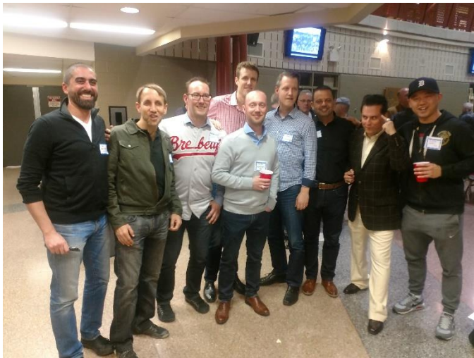
The class of 1993 celebrating their 25 th year since Graduation!

On May 13, the Alumni Association hosted its annual Pub Night Reunion. Over 100 alumni and staff returned to their alma mater to share stories, reconnect, network, and celebrate. Funds were raised for graduation scholarships and the football programme. The hockey team also made an appearance to thank alumni for all their financial and moral support for the OFSAA championships.