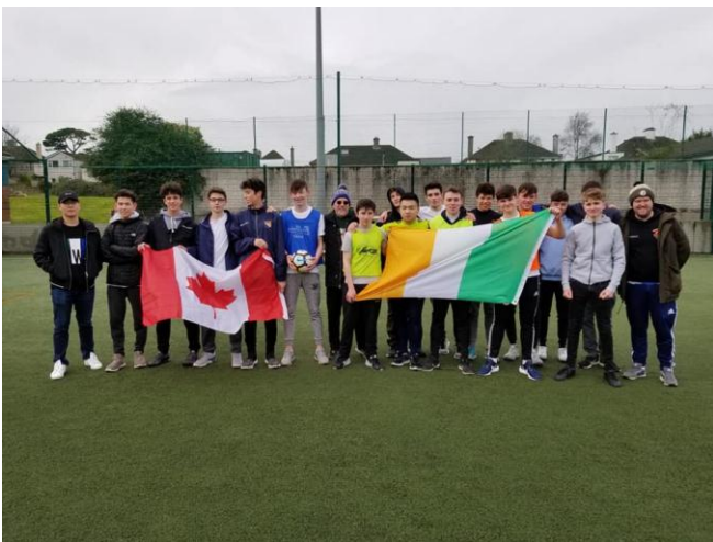
Canada v. the lads from Presentation College Bray in a friendly international soccer match