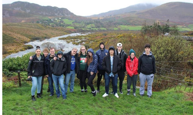
Cavorting in County Kerry, Ireland