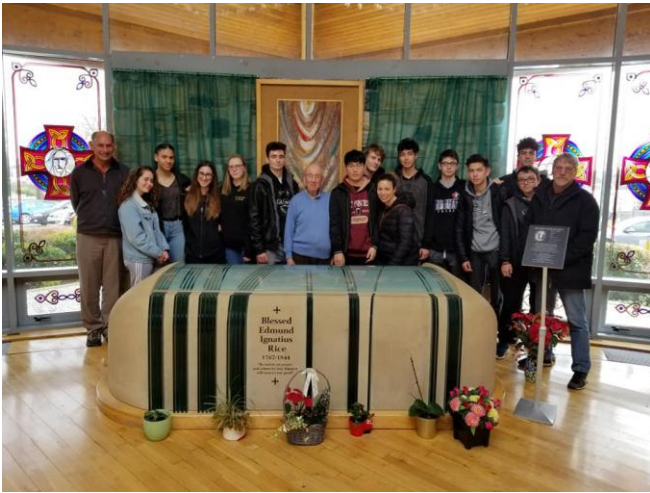
At the tomb of Blessed Edmund Rice, Founder of the Presentation Brothers, at Mount Sion in Waterford