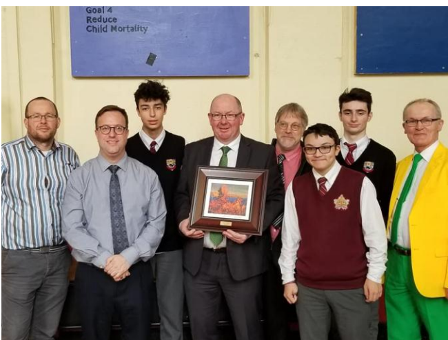
Presenting the Principal of Colaiste Chriost Ri (College of Christ the King), a Presentation Brothers' school in Cork, with a Group of Seven painting