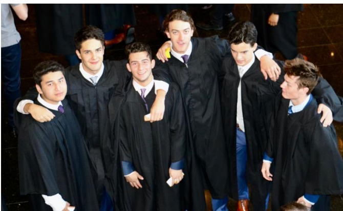
Brotherhood and Men for Others