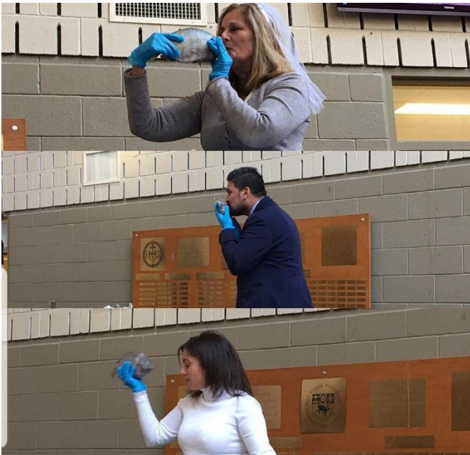
Teachers "kiss a fish" as part of the Can-Aid drive fun

Since 1984, Brebeufians have been collecting cans of food and funds to support the patrons of the Good Shepherd Centre on Queen Street. This year it was decided to hold it at Thanksgiving instead of Christmas. Over one thousand cans and $2000 was raised. Well done to all involved in this important charity.