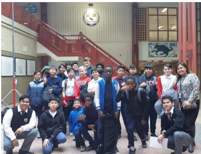
Elementary school boys visiting Brebeuf

On November 6, two hundred Grade 9 students visited the workplaces of their parents or other adults to give them the experience of the working world. Many students had never seen their parents at work and it was an important experiential opportunity for all.