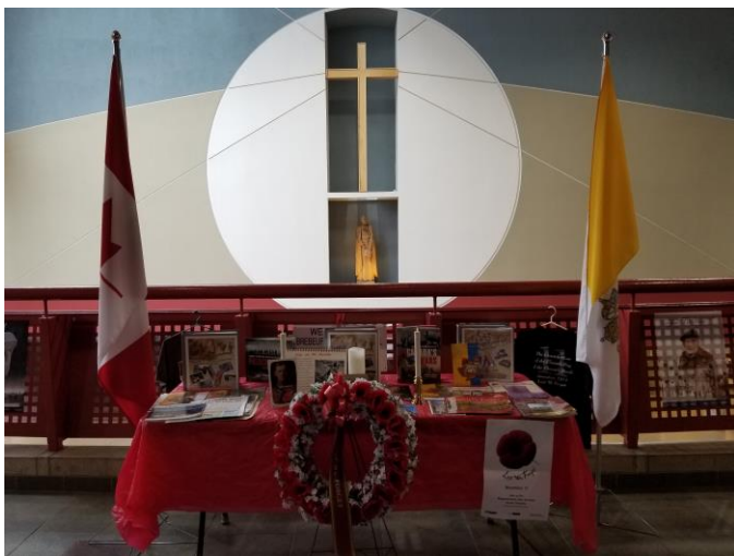
Brebeuf's Remembrance Day display

The Relations is the official newsletter of