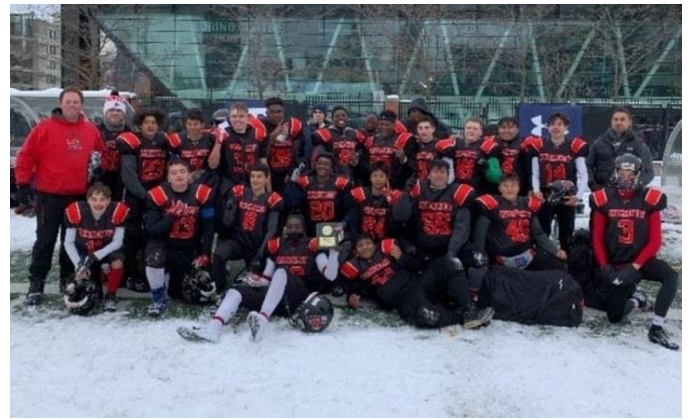
The Junior Football City Champions!